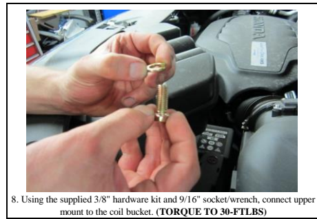
8. Using the supplied 3/8" hardware kit and 9/16" socket/wrench, connect upper mount to the coil bucket. (TORQUE TO 30-FTLBS)