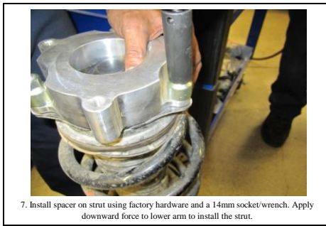
7. Install spacer on strut using factory hardware and a 14mm socket/wrench. Apply downward force to lower arm to install the strut.