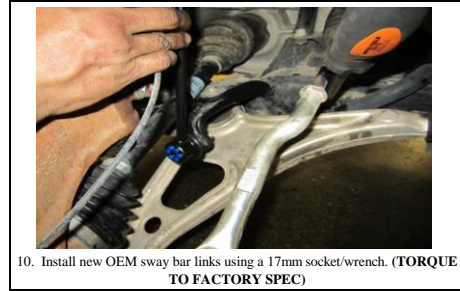
10. Install new OEM sway bar links using a 17mm socket/wrench. (TORQUE TO FACTORY SPEC)