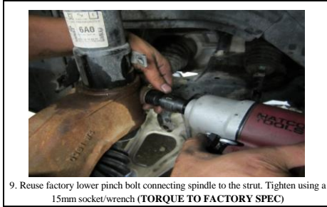
9. Reuse factory lower pinch bolt connecting spindle to the strut. Tighten using a 15mm socket/wrench (TORQUE TO FACTORY SPEC)