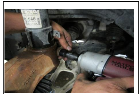
4. Remove the bolt that is clamping the strut attached to the spindle using a 15mm socket/wrench.