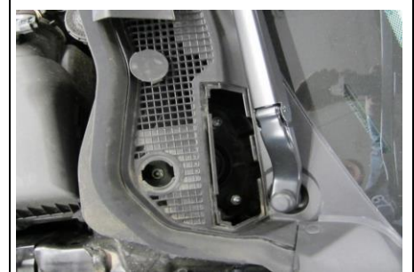
2. Remove plastic covers at the base of the windshield (IN THE COWL) in order to get to upper strut mounting hardware. Remove the 3 nuts holding the strut to the coil bucket using a 14mm socket/wrench.