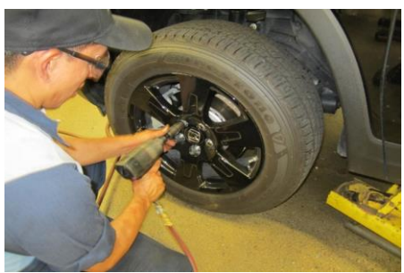
1. Raise front of vehicle and support the body with jack stands. Ensure jack stands are secure and set properly before lowering the jack. NEVER WORK UNDER AN UNSUPPORTED VEHICLE. Remove front wheels.