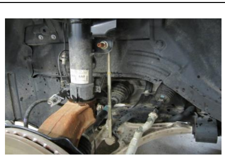
3. Remove sway bar link using a 17mm socket/wrench.